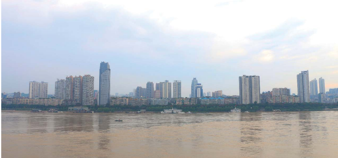
Figure 4 The Skyline of Luzhou

buildings and high-rises were also built to make the city more eye-catching (see Figure 4). In terms of the transportation infrastructures, Luzhou municipal government also endeavours to accelerate the construction of two new high-speed railways, open up four to five international air routes (there is none at this moment), and construct several light railways across the city (LMG, 2019).