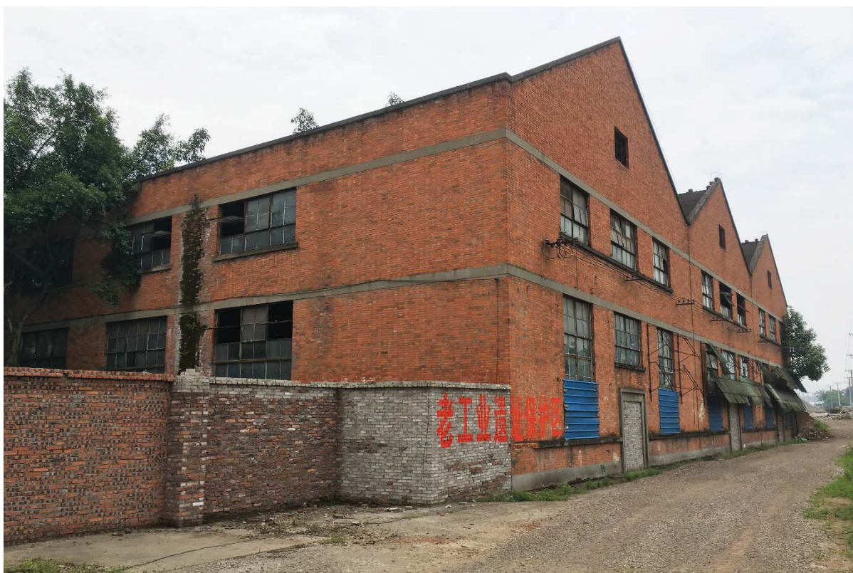
Figure 2 Industrial Plants built in the 1960s